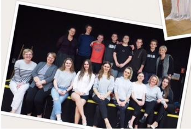
25 Mt Alexander Road Flemington