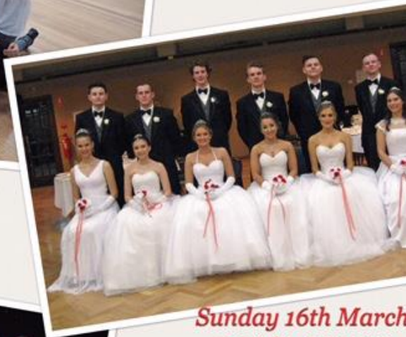
Sunday 16th March 2.00 to 4.00 pm