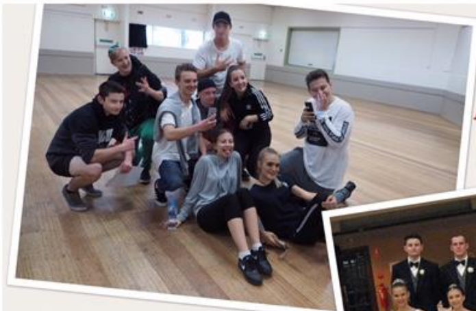
Polish debutante practice